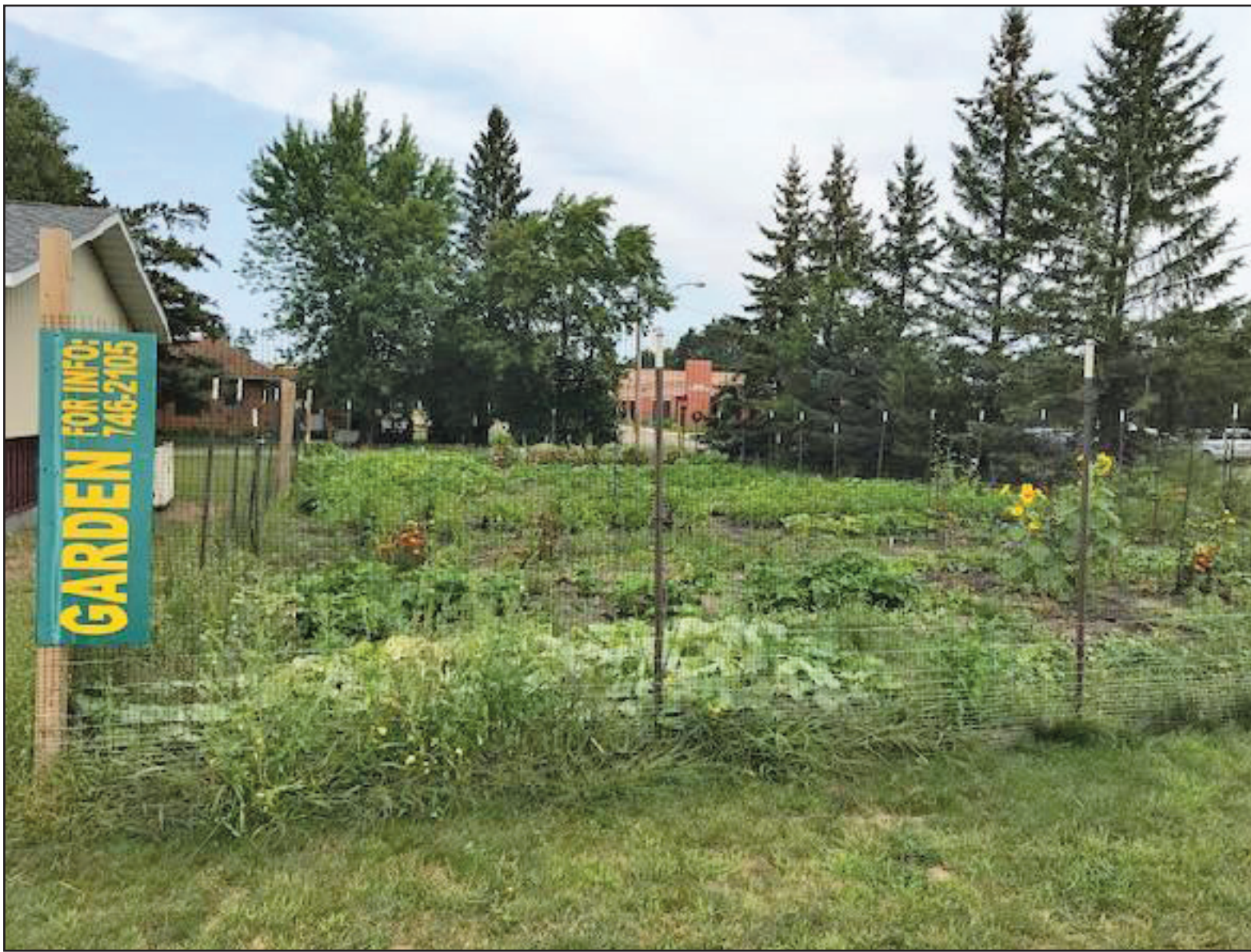
The Pillager Community Garden features high deer-proof fencing.

If interested, call Whitehead at (952) 220-1060 or come to the next meeting May 24, 6:30 p.m., at the site, just north of the car wash on River Street, Pillager.