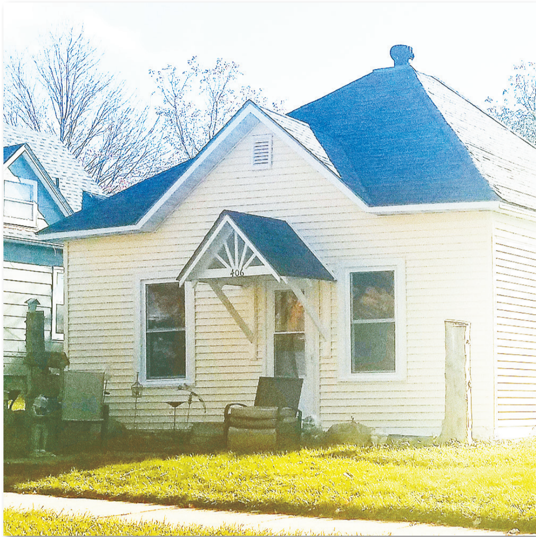
After photo of a home that had repairs made through the Lakes and Pines Small Cities Development program

Download the application on the Pine County Economic Development page or contact Lakes and Pines at lap@lakesandpines.org or call 320-679-1800 ext 123 or 133 for more information or to have a printed application mailed.