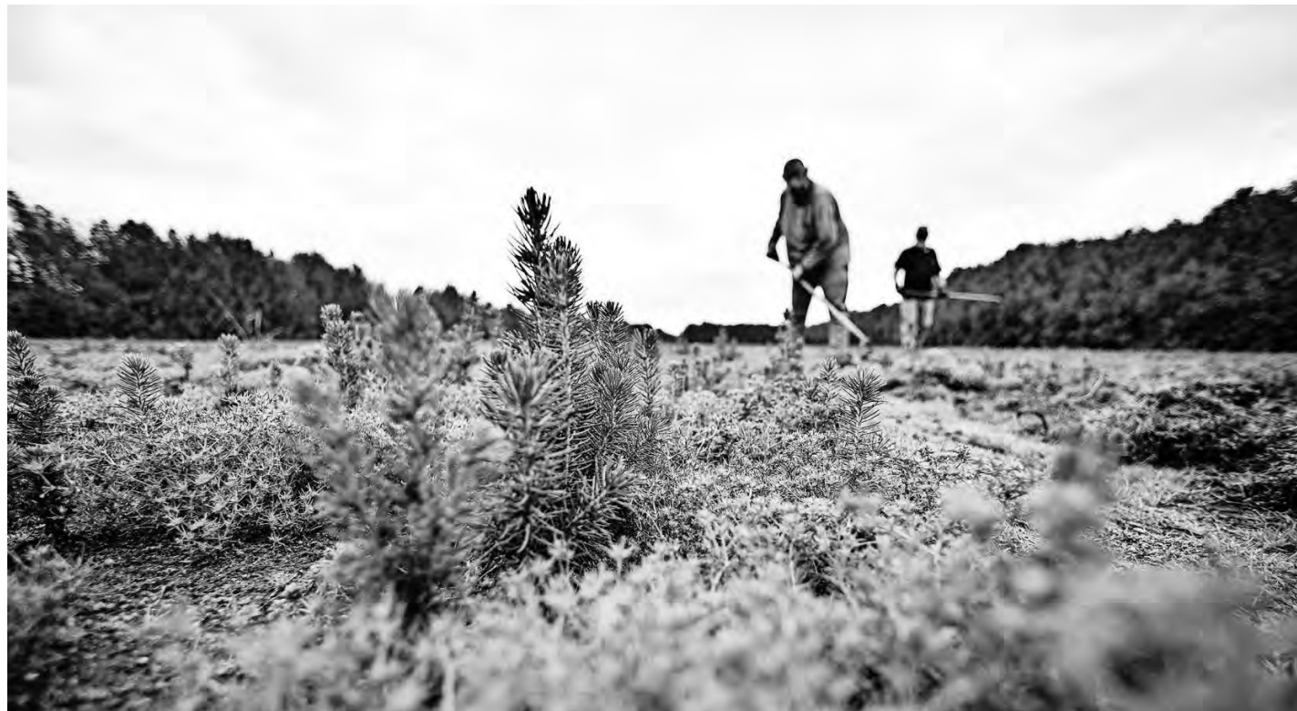
Jon and Dewayne Lesemoe hoe weeds from rows of trees growing on a plot on Oct. 6 in the Badoura State Forest Nursery near Akeley.