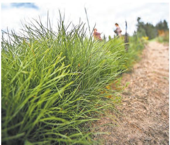
Small pines grow in the sandy soil Oct. 6 at the Badoura State Forest Nursery near Akeley.