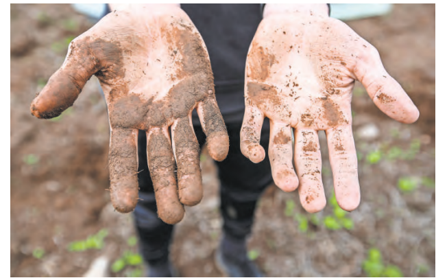
Soiled hands were a common experience shared by student volunteers who planted 825 northern red oak seedlings on Sept. 25, at the University of Minnesota Duluth Research & Field Studies Center north of Duluth, Minn.