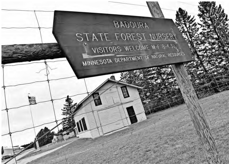
A sign greets visitors on Oct. 6 to the Badoura State Forest Nursery near Akeley.

State lawmakers did OK $5.35 million in the budget that passed in June for soil health practices through the Clean Water Fund and Board of Soil and Water Resources budgets.