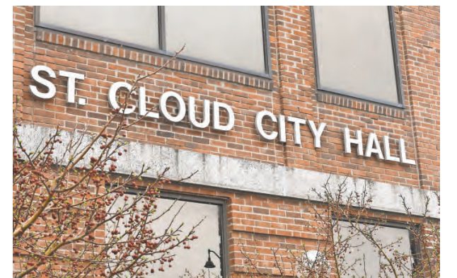
St. Cloud City Hall is pictured April 13 in St. Cloud.

100th ANNIVERSARY PARAMOUNT CENTER FOR THE ARTS