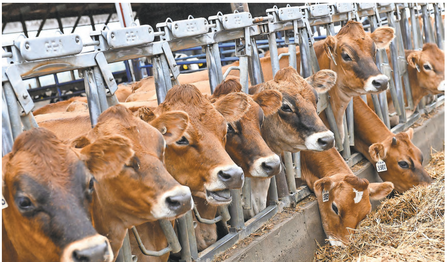
Cows feed contentedly at Lahr Heritage Acres Sept. 3, near Cold Spring.