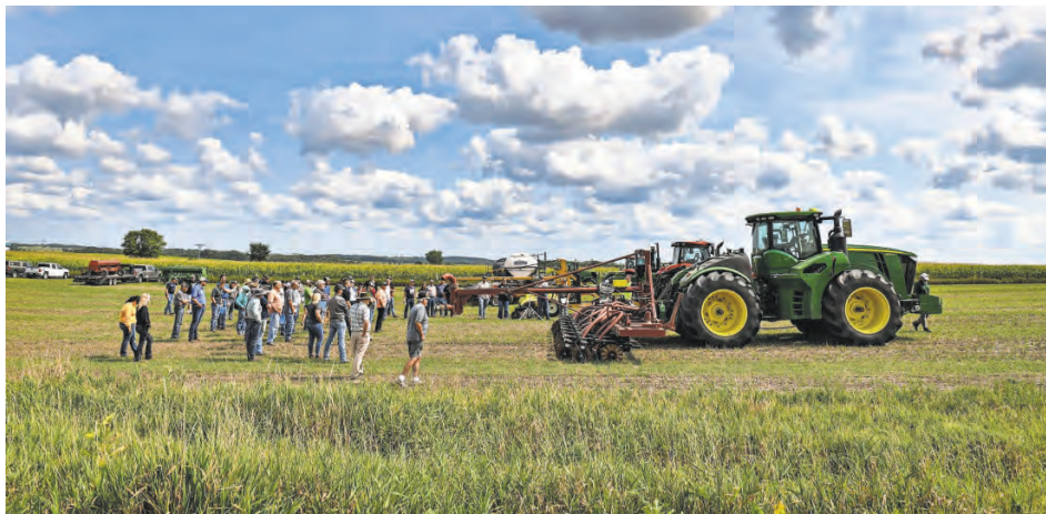
People gather for equipment demonstrations during a Soil Stewardship and Nutrient Management Field Day Sept. 1, near Albany.

And humans can help the process by growing more trees or helping crops deposit more carbon into the soil. Encour-