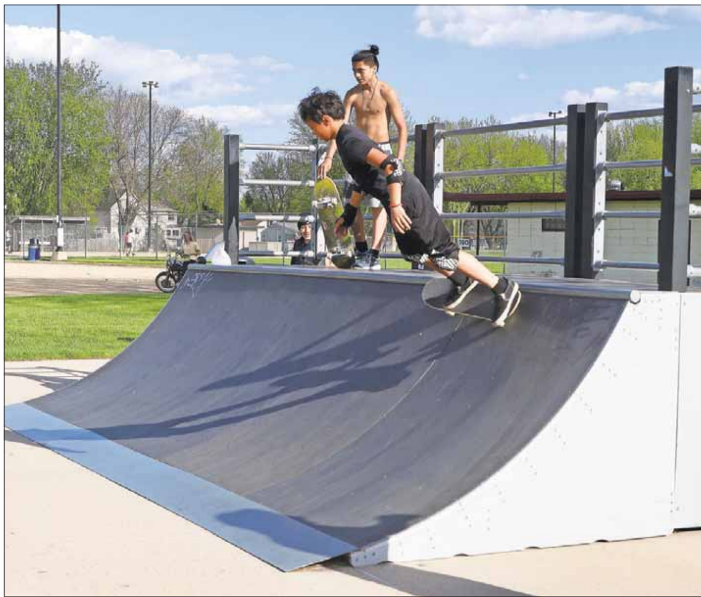
Skateboarders ride the ramp Sunday at Worthington's local park.

No. 40 Unlock digital at dglobe.com/activate