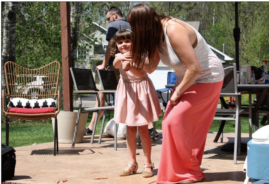
Grace noticed her new playhouse just moments after stepping into the backyard.