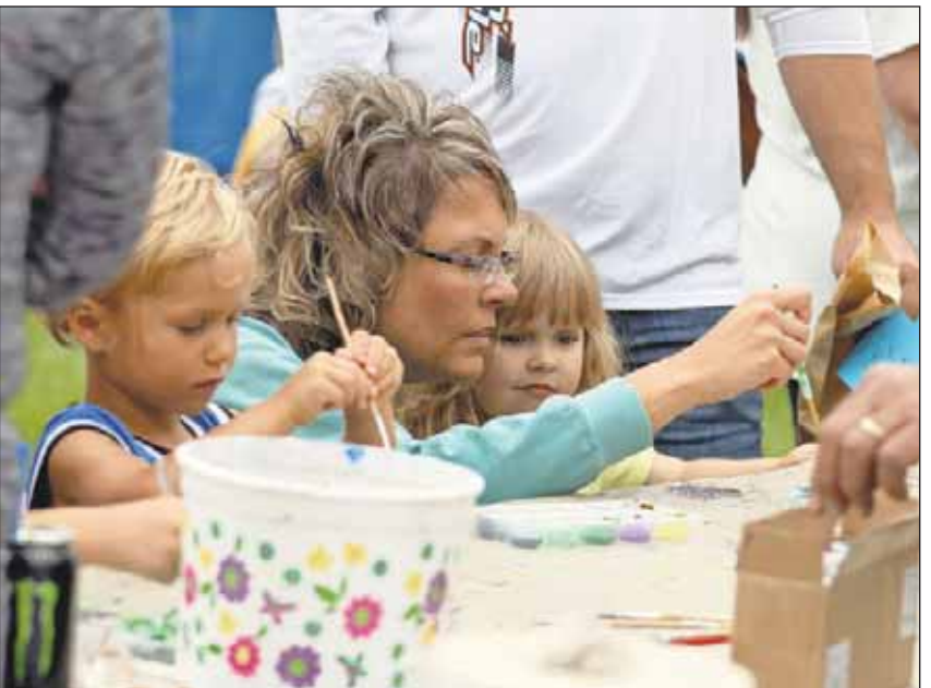
Above: Children paint suncatchers during the 2022 Worthington Windsurfing Regatta and Music Festival. Right: Children blow bubbles during the 2022 Worthington Windsurfing Regatta and Music Festival.