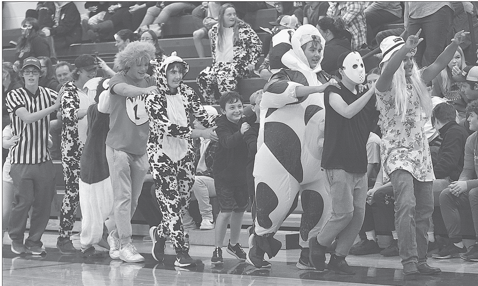
Barnum fans dance in a costumed conga line, with an abundance of cows, during Friday’s volleyball playoff game between Barnum and Cromwell-Wright. For more that game, see Page 27.