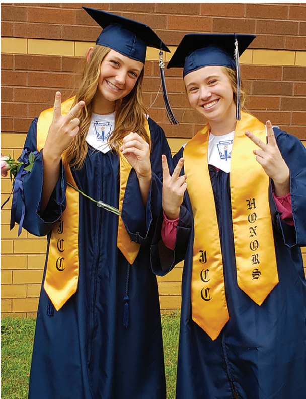
Inside... See more photos from Sunday's graduation ceremony at the Jackson County Central High School.