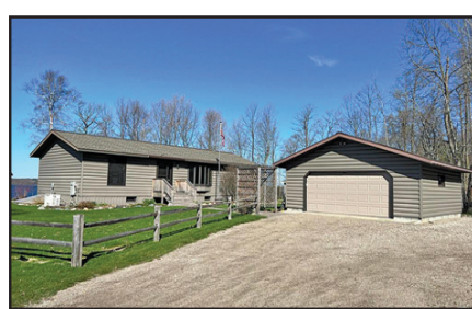
NEW LISTING (LEECH LAKE HOME)

NEW LISTING (WALKER HOME WITH LAKE ACCESS) 4 Bedroom 3 bath Leech Lake Access home nestled in the pines abutting the North Country Bike Trail only 3 miles from Walker. Home includes 3 bedrooms on the main level, large lower level bedroom w/ 2 egress windows, spacious kitchen with plenty of storage space, wood burning stove, large 3 season porch, private deck for entertaining, fenced in area, oversized 2 stall detached garage, 2 garden sheds for additional storage needs. Leech Lake access includes a covered harbor slip and beautiful sand beach.