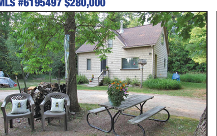
COMING SOON (LARSON LAKE HOME)

Charming homestead on Larson Lake located just east of Hackensack. This property offers two lifestyles...both lake living with 150 feet of level lake shore and country living with a private 2.69 acre lot. The home is 2 bedroom, 1 bath with open living room, kitchen and dining area. The original 2-story red barn with new roof is ready for you to decide how you'll use it. Property also includes a garage with lean-to and a second garage with unfinished guest quarters on the second floor. All buildings have newer roofs. There is a large, fenced in garden and 2 storage sheds.