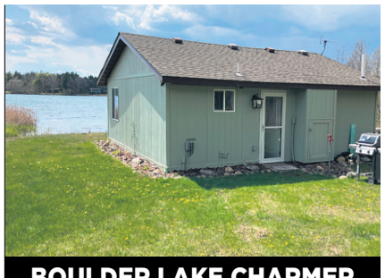
BOULDER LAKE CHARMER

This property boasts level, hard sand beach on the "gold coast' of prestigious Kabekona Lake with western exposure for amazing sunset views.