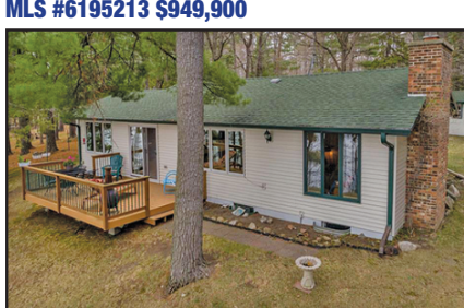
NEW LISTING (WEBB LAKE HOME)

Webb Lake Home! Year round home, well maintained, large pine trees, sand and rock frontage! Includes detached garage and small bunk house, set up and ready for summer. Great location located just outside of Hackensack on beautiful Webb Lake!