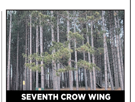
$67,000 | MLS# 6194231

Private, seasonal cabin situated 30' from the waters edge of beautiful Boulder Lake. 1.5 ACRES