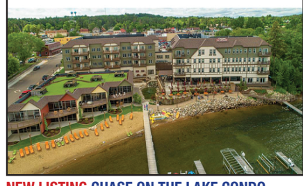
NEW LISTING CHASE ON THE LAKE CONDO Don't miss out on a great opportunity to own a piece of history at the Chase on the Lake Resort and Hotel on beautiful Leech Lake in Walker Bay. The Chase has had such great success on the rental of their unit they have decided to only sell a couple more units. This is a great opportunity to own a vacation property that supports itself, and don't forget the added bonus of being able to use it whenever you desire. Unit is city view on the 4th floor. MLS #6104715 $239.900

NEW LISTING LEECH LAKE LOT Beautiful Leech Lake lot! Enjoy breathtaking sunsets from this level, wooded 5.15 acre lot. Heavily wooded, mature trees, sand and rock frontage- must see! MLS #6101241 $219,900