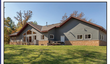
NEW LISTING HACKENSACK COUNTRY HOME Beautiful open concept home on 32.59 acres of hardwoods and open meadow, abuts State forest, trails and 2 heated deer stands in place, custom built home, in-floor heat (dual fuel), 9 foot and lofted ceilings, 2 main floor bedrooms (one is the master with large tub, walk in shower, walk in closet), 3 full large bathrooms, main floor laundry with built in stainless sink, main floor office. split rock backdrop to free standing fireplace, attached insulated and heated garage with a floor drain, and two shop garages. MLS #6108562 $475,000

UpNorthPropertySearch.com This Week's Featured Listings