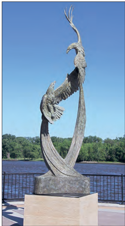
Balance of Power