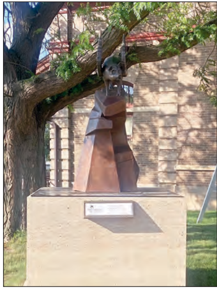
Time To Fly