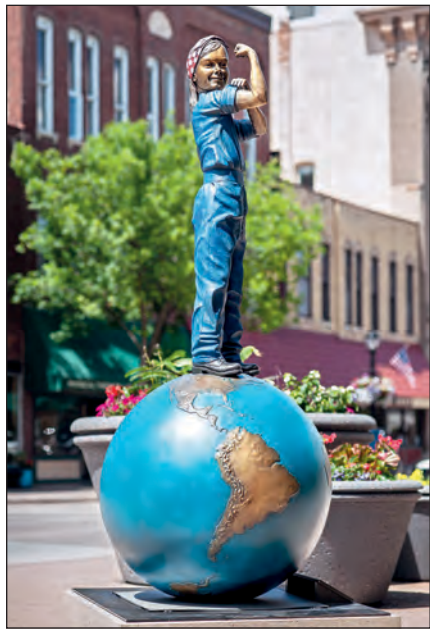
We Can Do It!