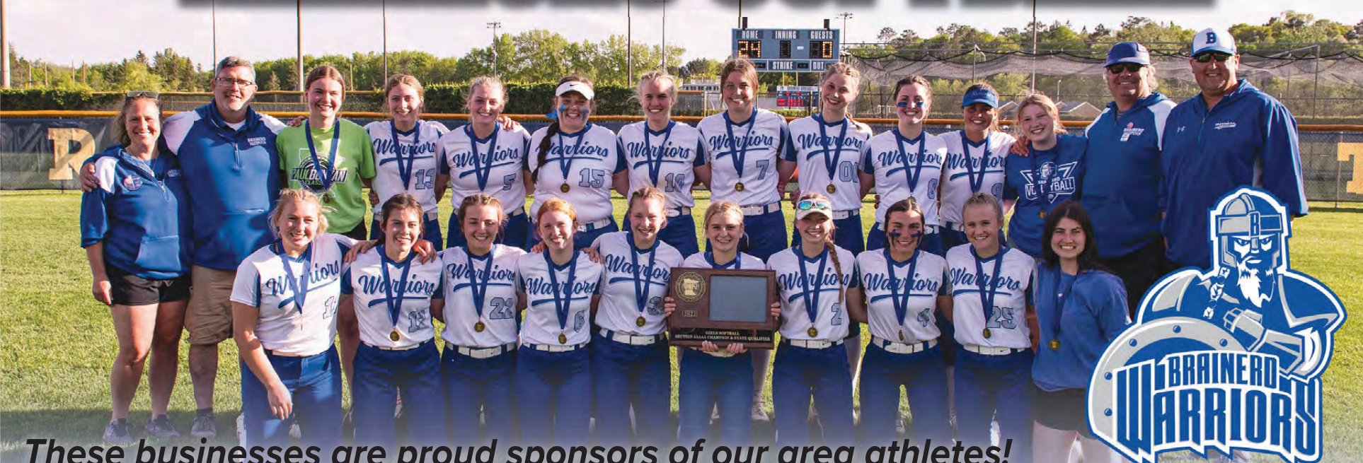
These businesses are proud sponsors of our area athletes!