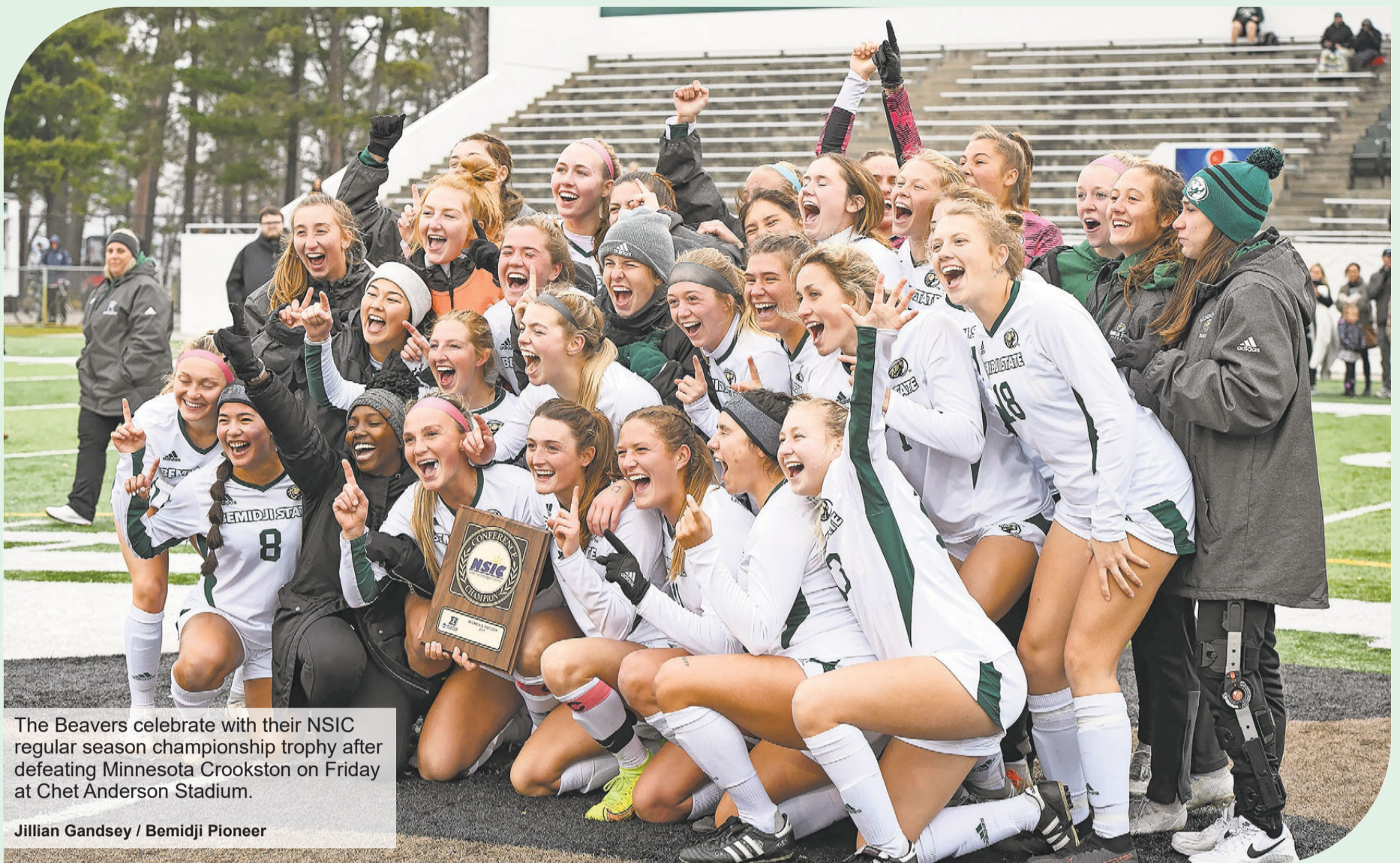
The Beavers celebrate with their NSIC regular season championship trophy after defeating Minnesota Crookston on Friday at Chet Anderson Stadium.