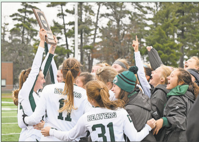
The Beavers celebrate with their NSIC regular season championship trophy after defeating Minnesota Crookston on Friday at Chet Anderson Stadium.