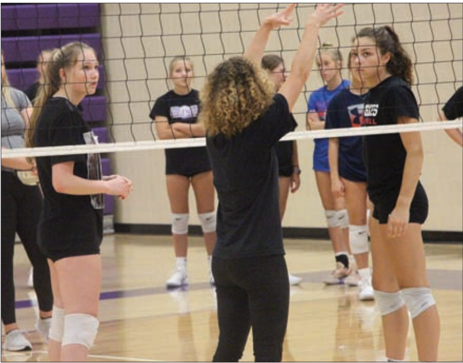
(8-21-22 Flyers Volleyball)