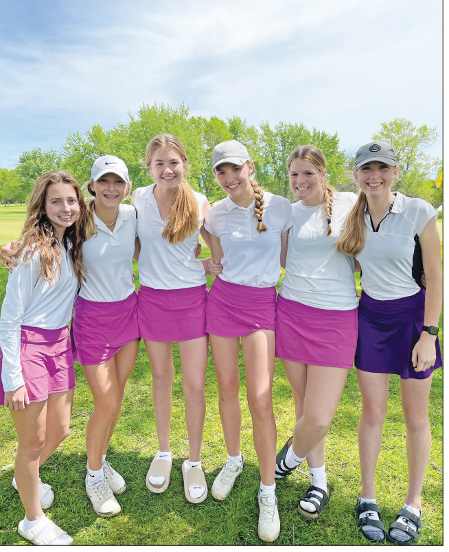
The Bison placed sixth with a team score of 751 in last week's Section 8AAA girls' golf tournament at Rich Springs Golf Course in Cold Spring. It was the first time the

musicians from Chamber Strings I, BHS Singers, Jazz I, Concert Orchestra, Concert Choir and Concert Band