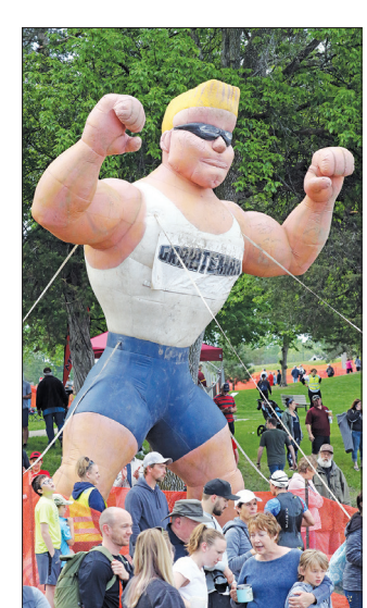
The Graniteman stood tall at Sturges Park for the start of Sunday's Buffalo Triathlon. See more Page 13A.