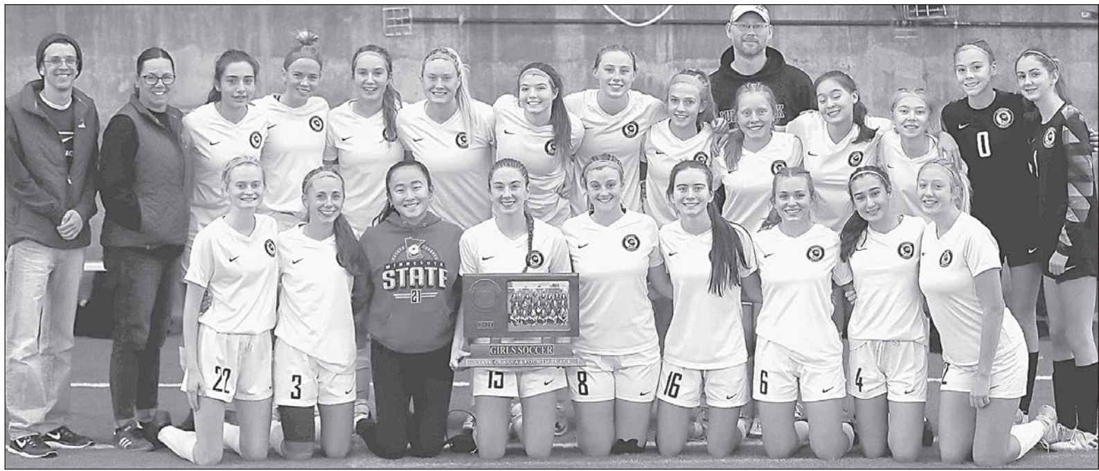
The Lumberjacks girls soccer team posed with the fourth-place trophy after making a run at the state soccer tournament last week.