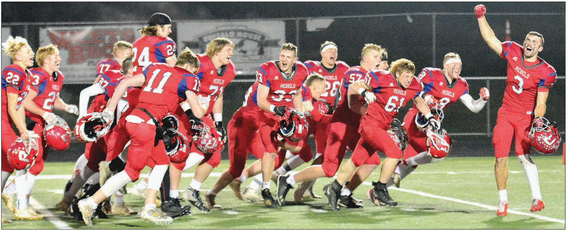
The Moose Lake/Willow River football team celebrated another entry into the state football tournament last week after a 63-0 drubbing of Mesabi East in the Section 7AA championship game in Esko.