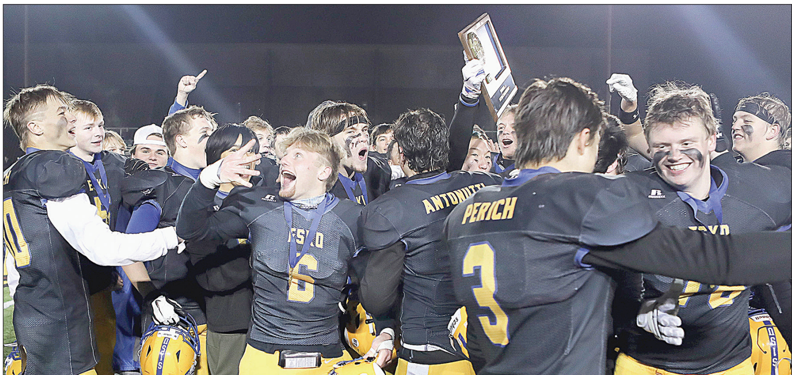
The Esko team celebrates after a wild win in Duluth last week and a section championship.