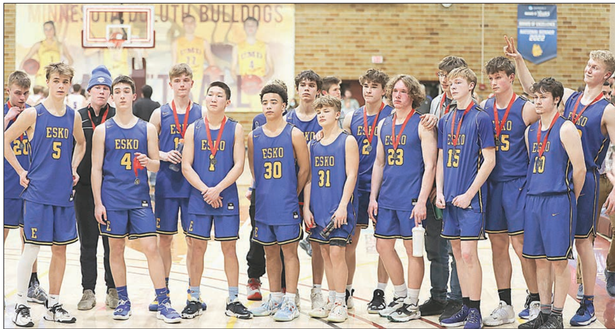
The Esko boys basketball team poses for a photo following their 58-50 Section 7AA final loss to Pequot Lakes Thursday at the University of Minnesota Duluth.

As with Barnum — the other Carlton County team in a section final — the day went a little sideways before the game even started. A bomb threat meant Esko