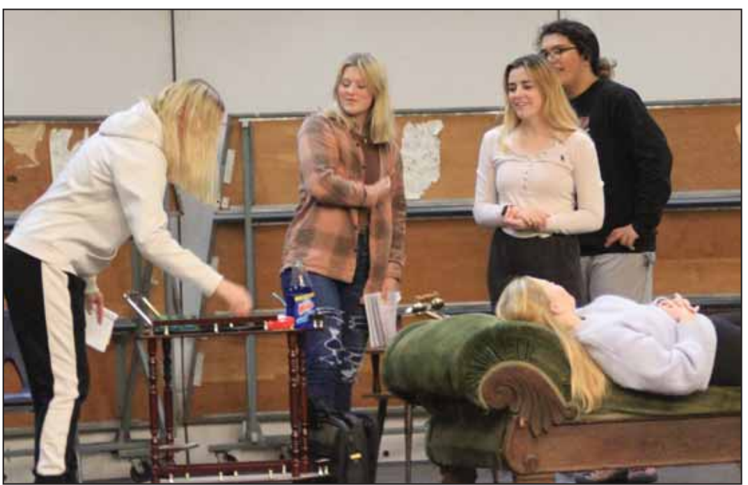
The New York Mills drama department will host "The Play That Goes Wrong" from November 18-20 at school.

The New York Mills Eagles defeated the Breckenridge Cowboys in the Section 6A championship game on Friday night by a score of 32-0. With the win, the Eagles qualified for their first state football tournament since 2006. For more information about the state tournament check out page 9.