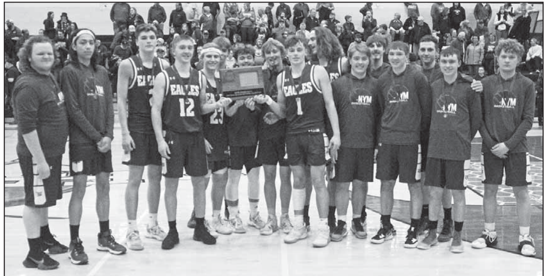
The New York Mills Eagles celebrated their sub section championship on Tuesday night in Perham

NY Mills led the Hornets by a score of 31-21 at halftime, and by as many as 20 points, with about 10 minutes remaining in the second half. Henning went on a late run to cut the lead to a single possession with about 3 minutes remaining the game, before the Eagles were able to break the Hor-