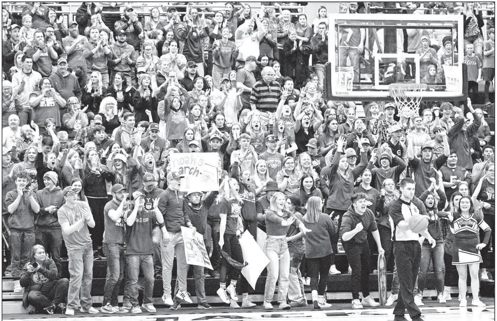
The stands were filled with Eagle fans during Tuesday's sub section championship game against Henning in Perham. There was plenty to cheer about as the Eagles defeated the Henning Hornets in the sub section championship game.