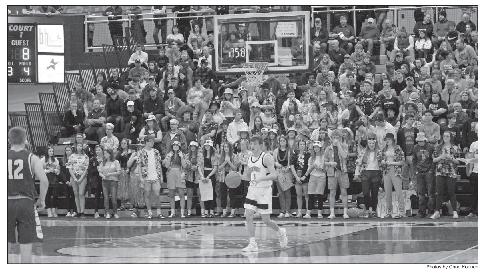
The Henning fans were out in full force on Tuesday night. The students dressed in a full Hawaiian theme with floaties, sun hats, sun glasses and more.