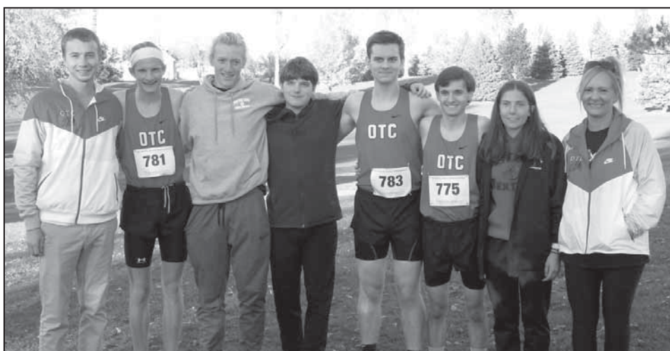
The Otter Tail Central cross country teams wrapped up their seasons at the section meet on October 29.