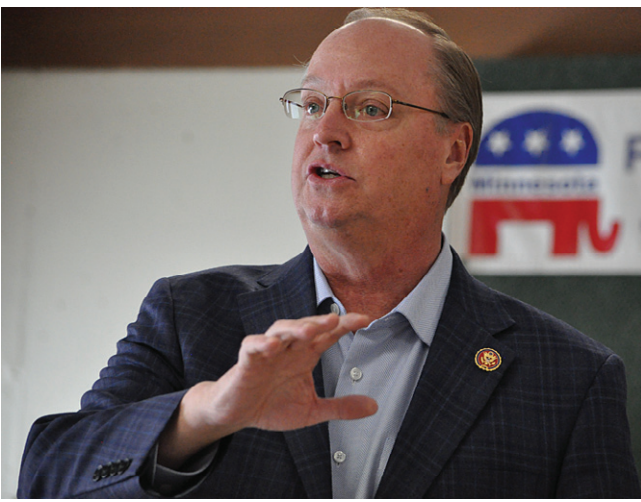
Local U.S. Rep. Jim Hagedorn speaks at the 2019 Jackson County GOP Convention in Lakefield. Hagedorn died last week at the age of 59 following a long battle with kidney cancer.

On Tuesday, Gov. Tim Walz issued a writ of special election setting dates of the filing period for the seat. Affidavits of candidacy and nominating