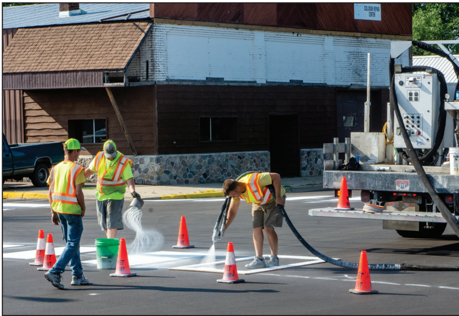
Road repairs in Verndale continued on Tuesday, August 2, as Traffic Marking Services was busy painting lines and other road markings on the newly paved roads. The crew worked quickly to paint and spread a reflective glass bead on the wet paint to make the lines reflective.