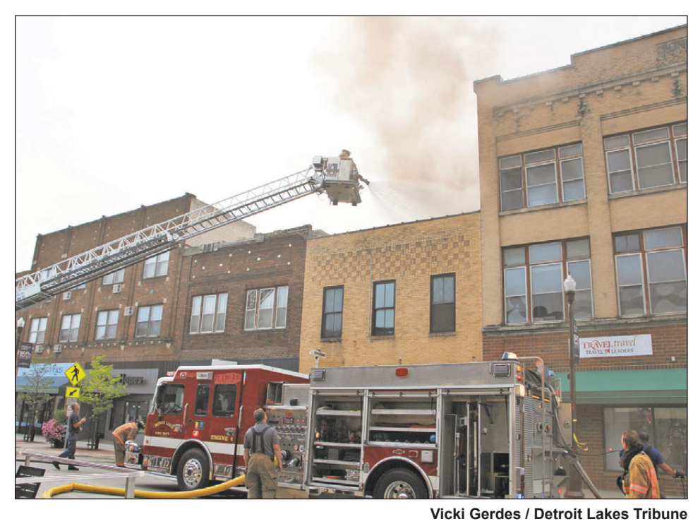
Firefighters shot over 300,000 gallons of water onto a downtown fire in Detroit

bonding authority: It county. All the property has about $10.4 mil- in Becker County is curlion in existing debt, rently valued at about and even after the new $7.53 trillion. By law, the county can't take on debt over 3% of that estimated market value, so that sets the county's debt ceiling at about $226 million.