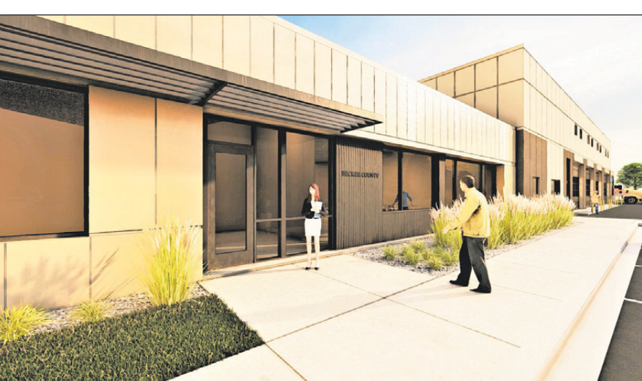
McGough Construction of Fargo / Tribune

Royal Throne and surrounding ice sculptures will most likely continue up until the Grand Lighting Ceremony at 7 p.m. on Friday, Feb. 11.