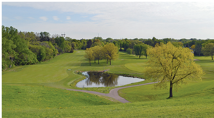
The enlarged pond between Holes 2 and 16 filters more water before it reaches the Mississippi River.