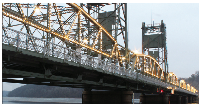
Last year the city installed lights on the south side of the historic lift bridge, this year the city will pay for installation on the north side and rely on downtown businesses to fund installation for the south side.