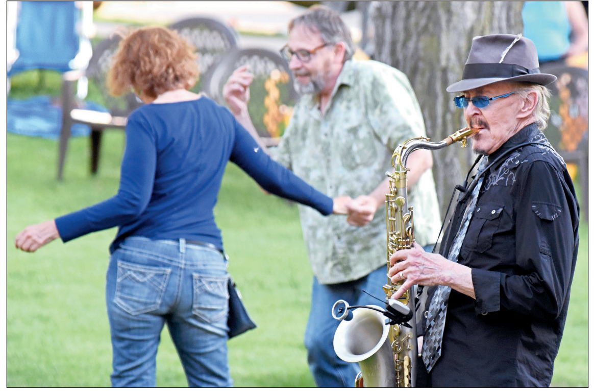
With the sax player playing the blues, people in the audience danced on the lawn at Central Park.