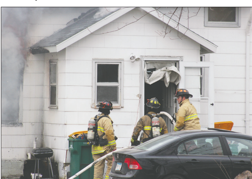
See FIRE, Page A9