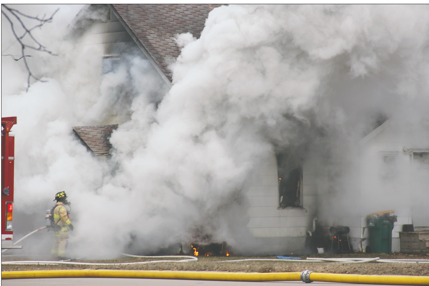
Albert Lea firefighters battle a house fire at 116 W. Seventh St. Wednesday morning. One person was injured after a man reportedly threw accelerant on her and then lit her on fire. She was taken to the hospital in an ambulance.