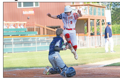
Starting on Page 14