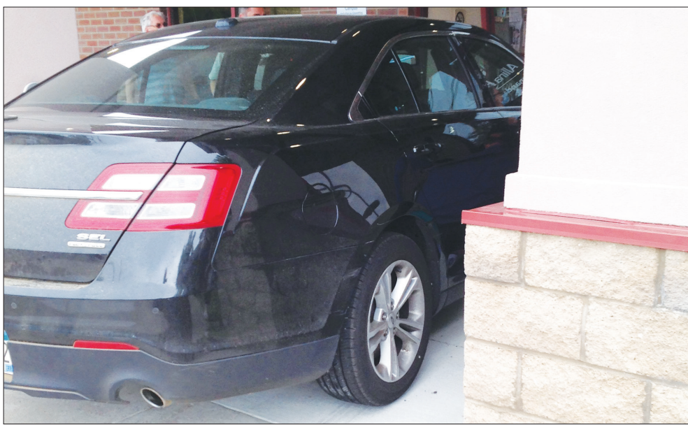
One person was injured after the accident last Tuesday. The driver was able to go home with her family after giving her statement.