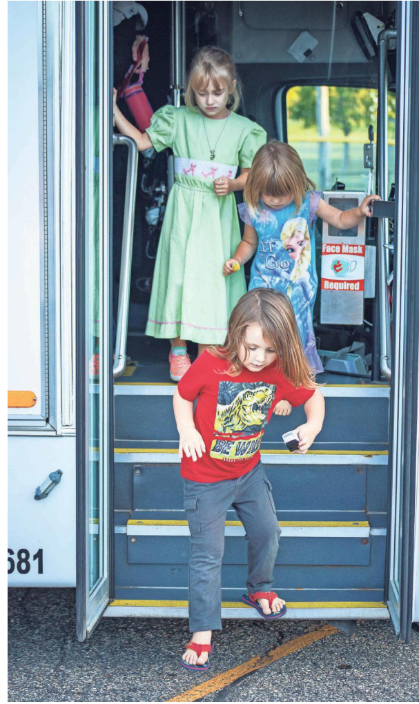
Kids explore the Prairie Five bus.