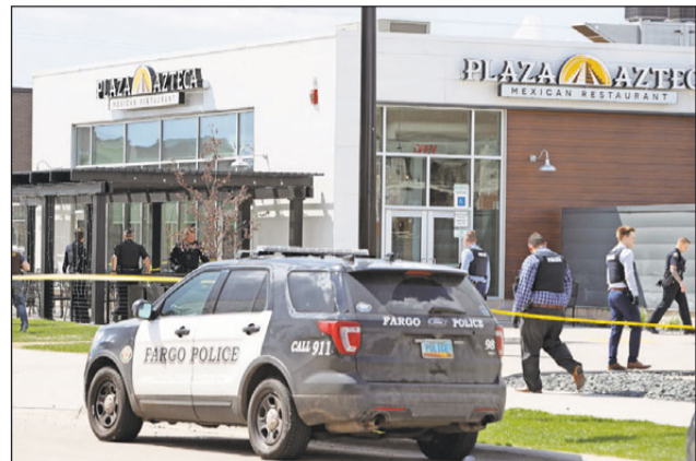
Law enforcement officers investigate a shooting on Wednesday at Plaza Azteca Restaurant in south Fargo.