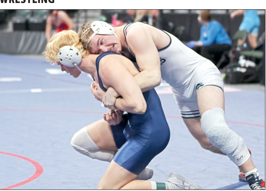
MARTIN SCHLEGEL / O'ROURKE MEDIA GROUF