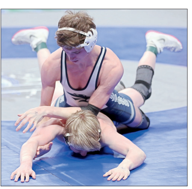
ALEC HAMILTON / O'ROURKE MEDIA GROUP