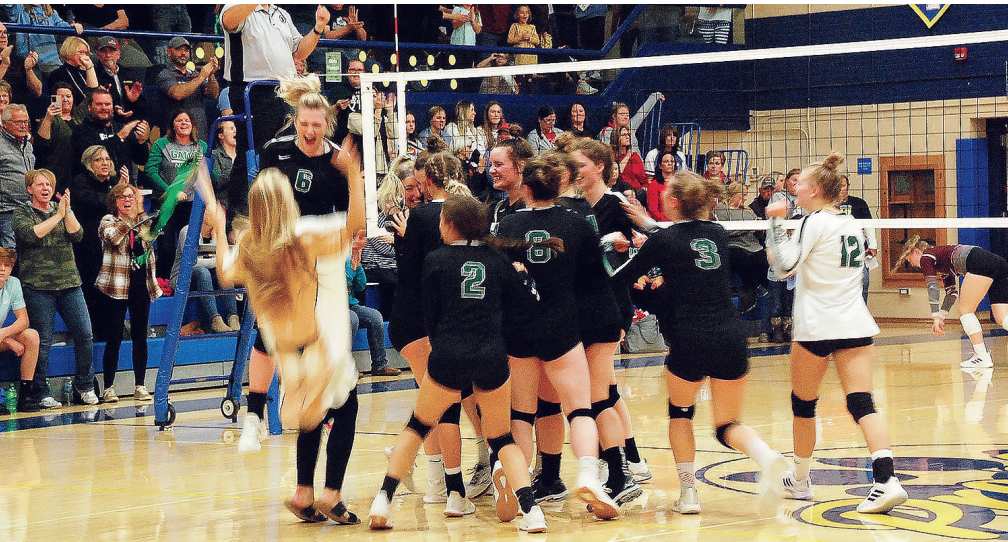
The Gator Volleyball team celebrates together, as Gator fans stand and cheer, following the team's 3-1 victory over the Fosston Greyhounds in the semifinals of the Section 8A Volleyball Tournament from Lincoln High School in Thief River Falls on November 1.