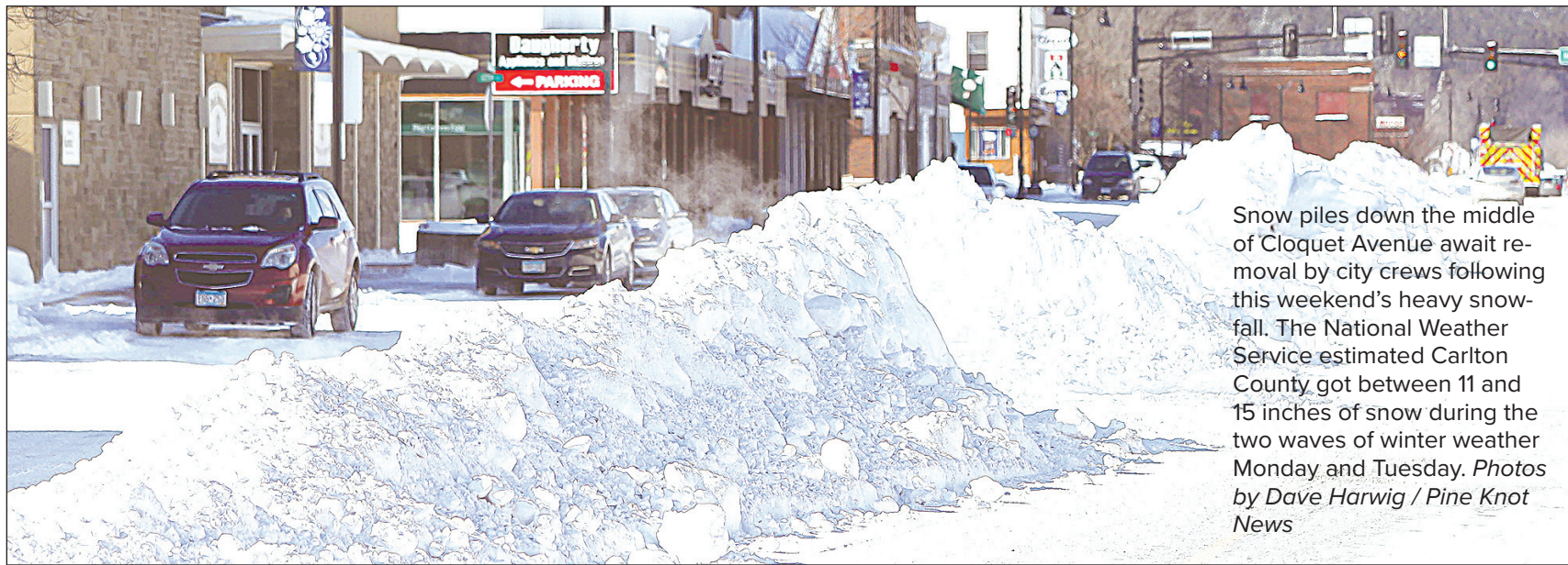
Snow piles down the middle of Cloquet Avenue await removal by city crews following this weekend's heavy snowfall. The National Weather Service estimated Carlton County got between 11 and 15 inches of snow during the two waves of winter weather Monday and Tuesday.