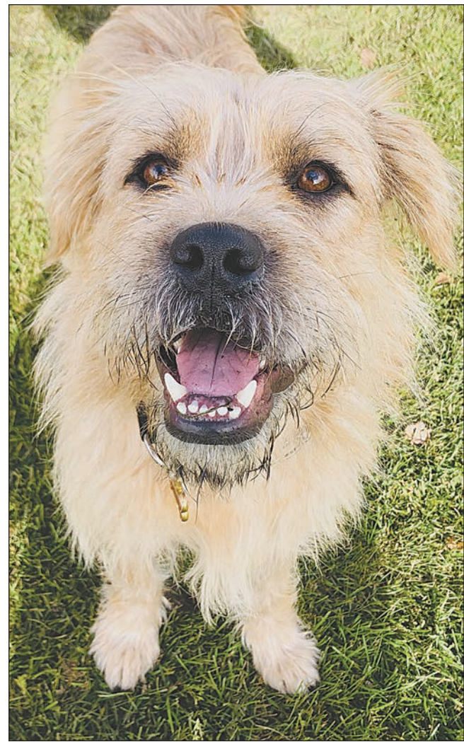
Curly was hit by a car in August 2021 and found lying in the middle of the road. He needed weeks of ongoing care. Curly was fostered, cared for, and when he was well, he was adopted.