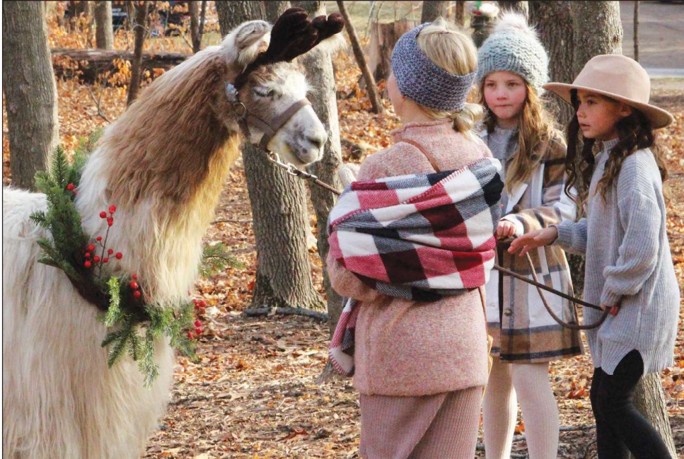
The holiday llamas were a popular attraction at the Northern Express event in Excelsior Dec. 3.