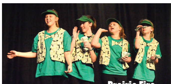
Prairie Fire Childrens Theatre 'Wizard of Oz'