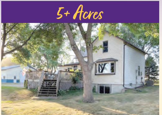
251 135th Avenue SW, Willmar, MN $387,000 MLS #6238136