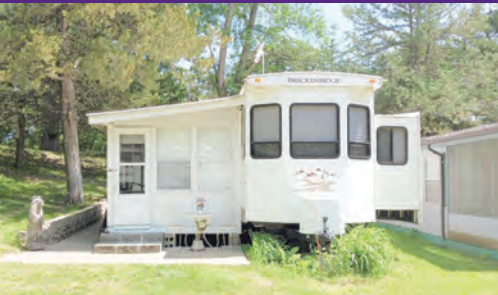
4808 132nd Avenue NE #6, Spicer, MN MLS #6222968 $75,000