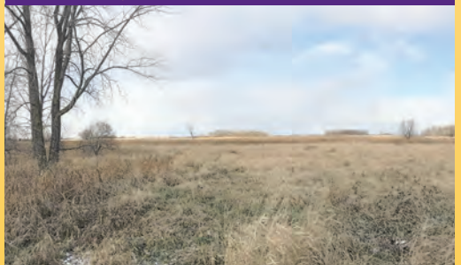
9144 123rd Avenue SE, Lake Lillian, MN MLS #6162969 $87,700