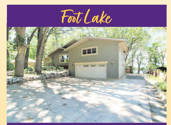
615 Knollwood Drive NW, Willmar, MN MLS #6188640 $365,000