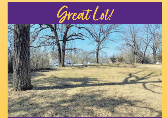
305 1st Avenue SE, New London, MN MLS #6145505 $47,000