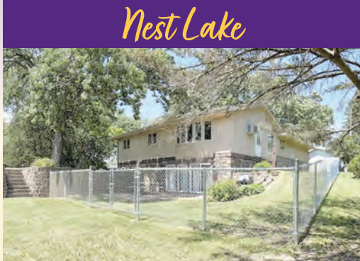
5559 153rd Avenue NE, Spicer, MN MLS #6228203 $367,000