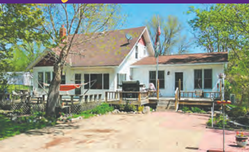
8489 187th Avenue NE, New London, MN MLS #6174222 $267,000