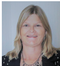
BARB JEFFERS Photo Journalist