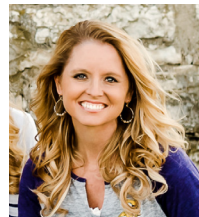
HEATHER KLEIBOER Photographer