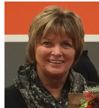
DEBRA FINSETH Photographer