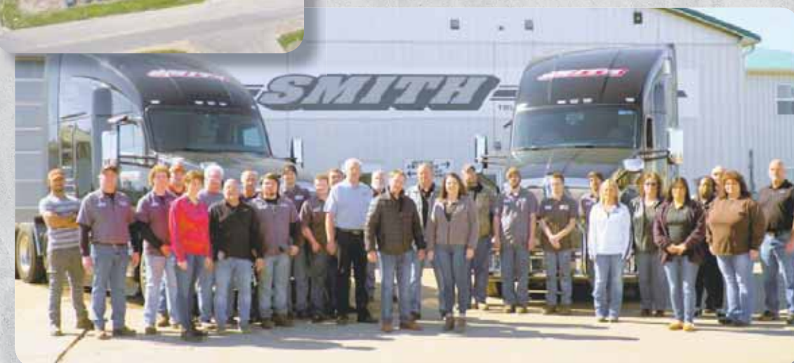
2019, Smith Trucking Head Office & Terminal in Worthington, Minnesota