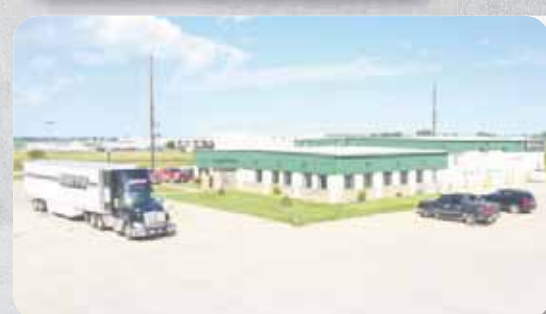
Sioux City Terminal in Iowa