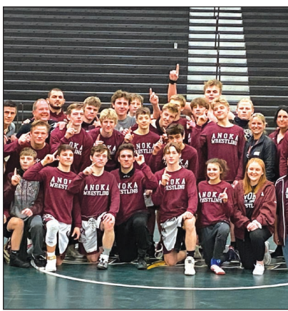
Anoka wrestlers advance to state semis