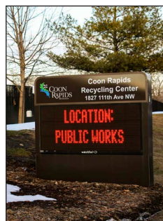
Coon Rapids gets recycling grant Page 3A