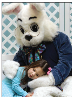
Northtown hosts Easter events Page 2A