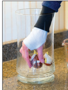
Master Gardeners: Forcing bulbs Page 5A