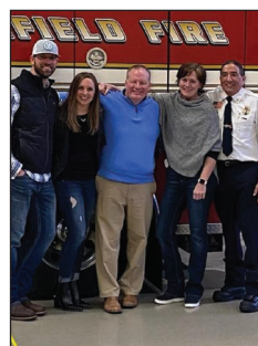
State Patrol honors Ramsey nurse for saving a life Page 12A