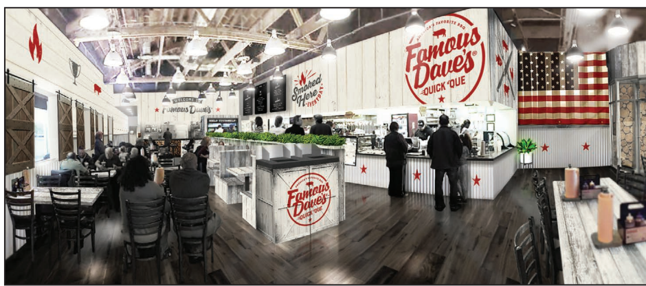
Famous Dave's in Coon Rapids is being rebuilt as a "Quick Que" location with cafeteria-style dining. It will be in a three-tenant building at the same location as the former restaurant.