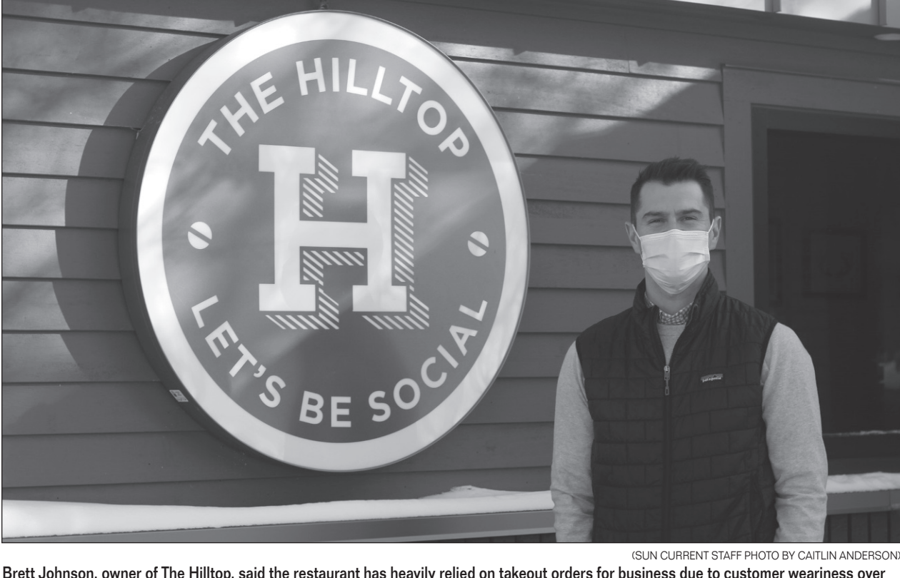
eating inside a restaurant. The restaurant started a new position at the restaurant that deals with takeout orders only during the pandemic.

Receiving Paycheck Protection Program - or PPP - loans from the federal government were also cited by owners as helpful.