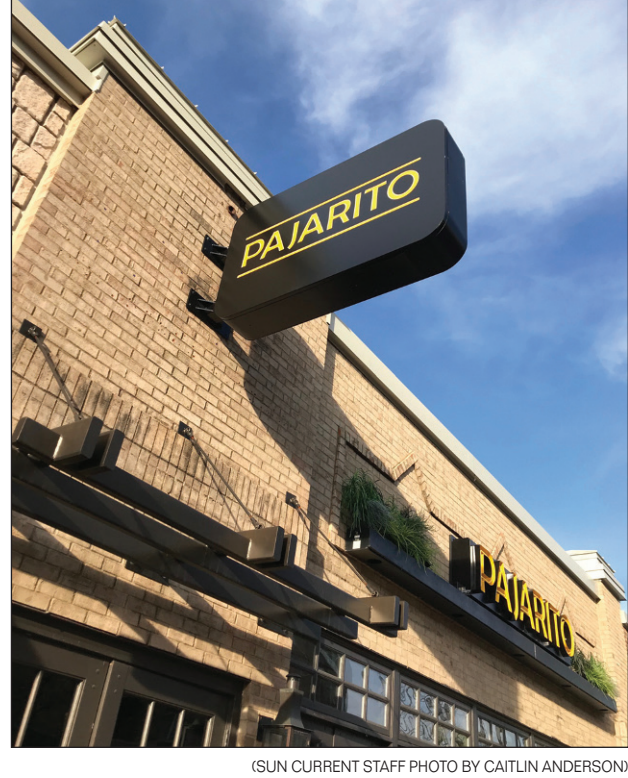
Pajarito, located at 50th & France, has never been able to open at full capacity. The restaurant was scheduled to open two days after Gov. Tim Walz ordered the closure of restaurants in March.

To-go orders have been a focus since March, because for many restaurants, this was one of the only ways they could continue to operate during times of clo-