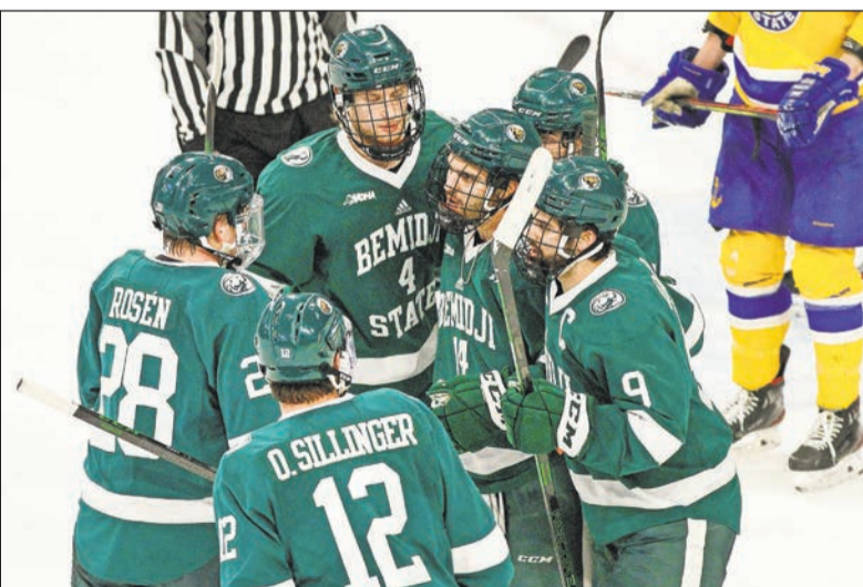
Bemidji State players celebrate a goal against Lake Superior State in the third period Friday, March 19, 2021, during the WCHA semifinals at the Mayo Clinic Health Systems Event Center in Mankato.