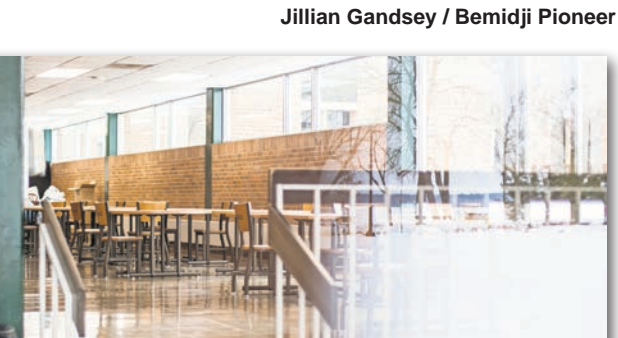
ABOVE: Chairs sit empty in the Lakeside Dining Center on Monday, Jan. 11, the first day of spring semester classes at Bemidji State.

ABOVE: Ridges of ice jut out along the Lake Bemidji shoreline on Saturday, Jan. 16, near Lake Bemidji State Park. According to the Minnesota DNR, when water rises in cracks in the ice and then freezes, this causes the ice sheets to expand slightly. And as rising air temperatures warm the ice, the additional expansion causes the sheet to thrust against the shore. The expanding ice sheet moves soil to create ice ridges as high as five feet or more. Ridges like this are more prominent during winters where less snow is insulating the ice.