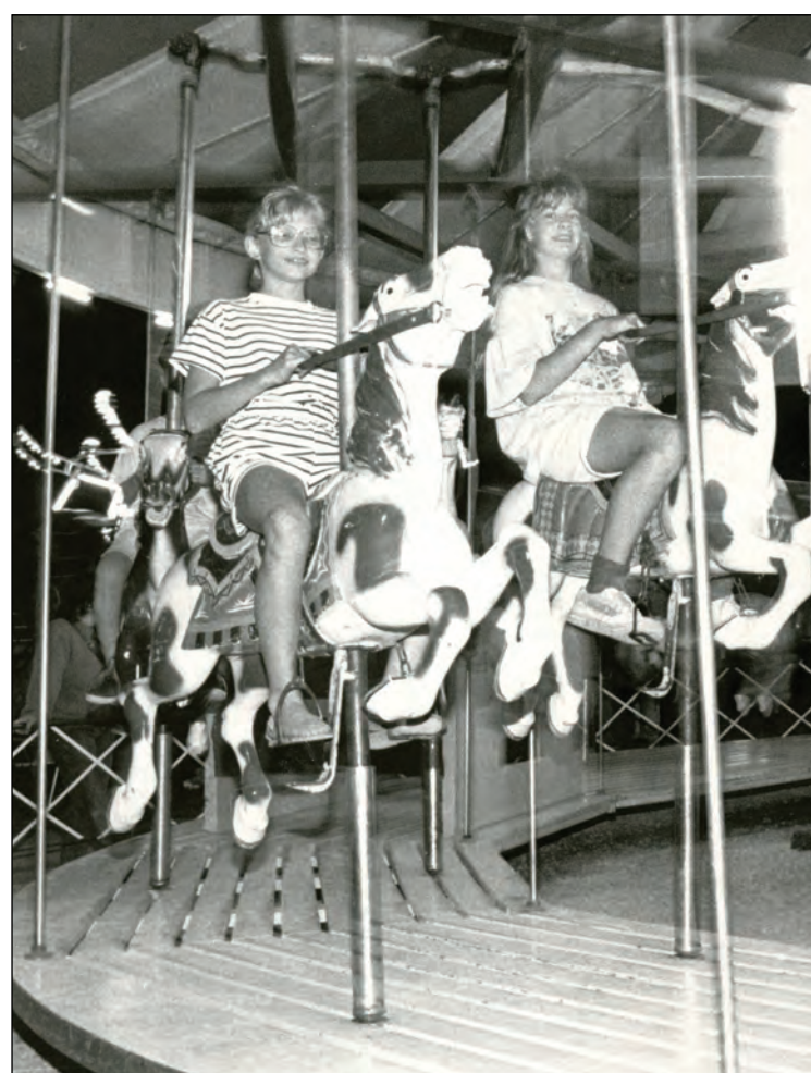
Fair goers enjoy the County Fair merry go round in 1990.