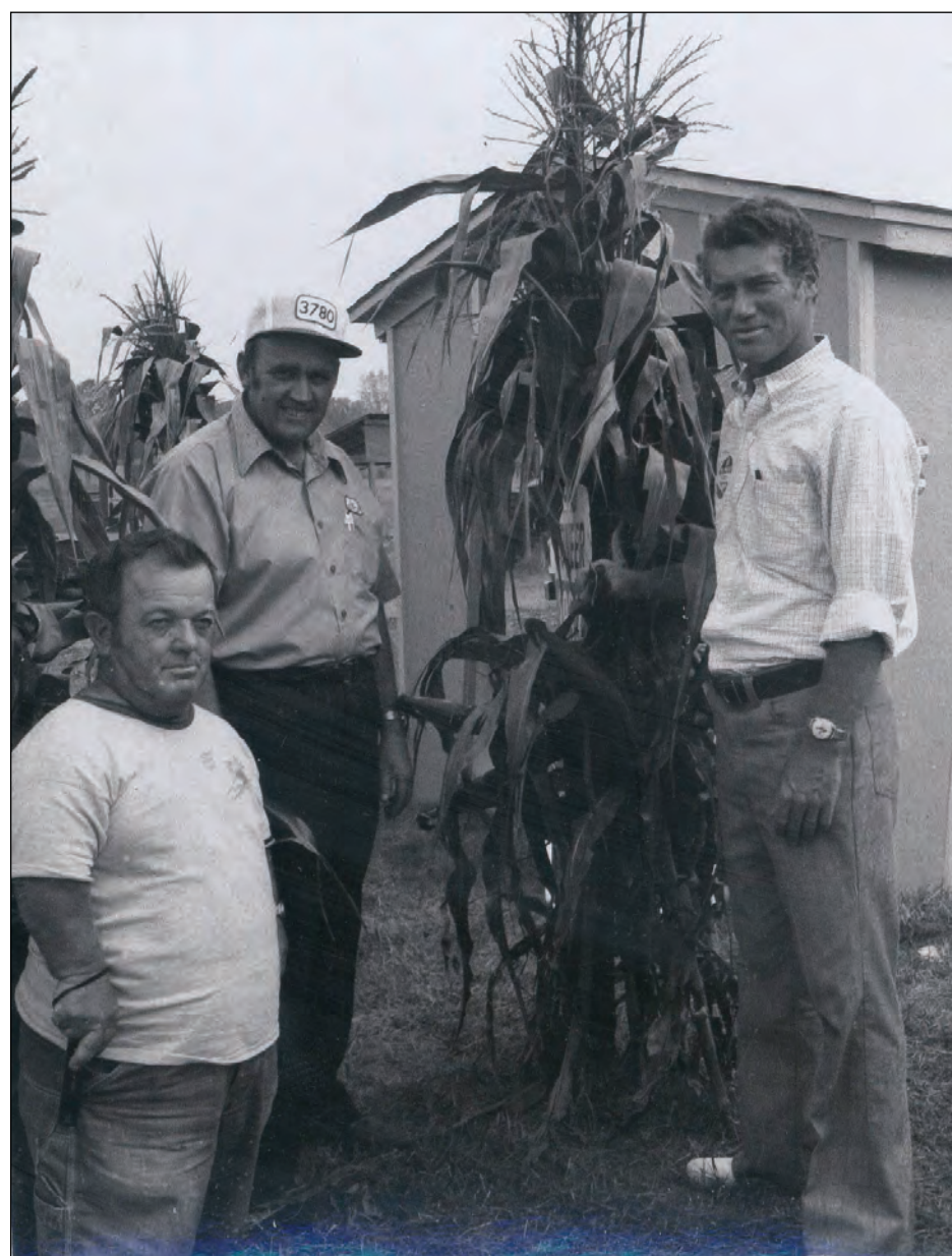
Former Minnesota Gov. Wendell Anderson stands by corn stocks at the Washington County Fair in the 1970s.