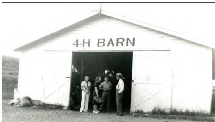
The Washington County Fair 4-H Barn in approximately 1941.

1883 and was held in the driving park again from 1883 to 1886