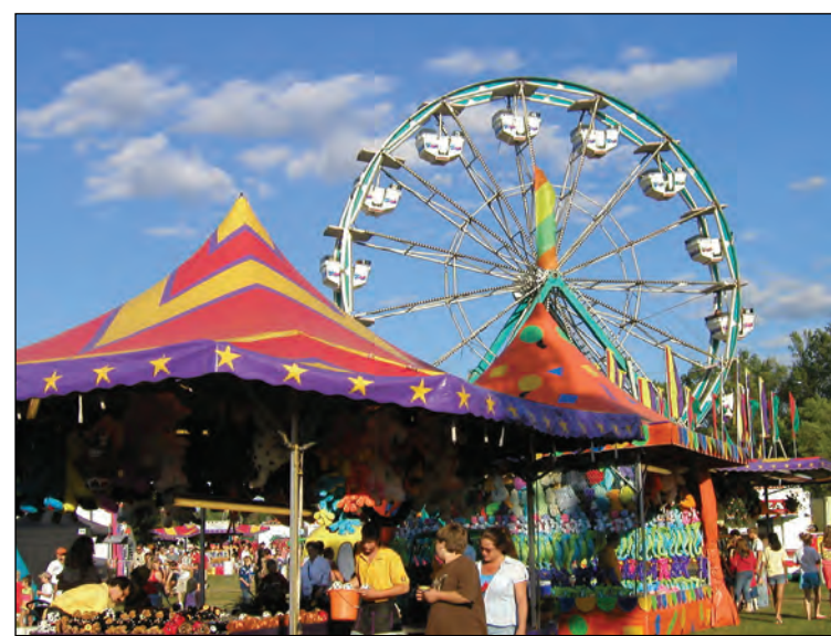
More rides, buildings and exhibits were added to the fair since the 1920s.