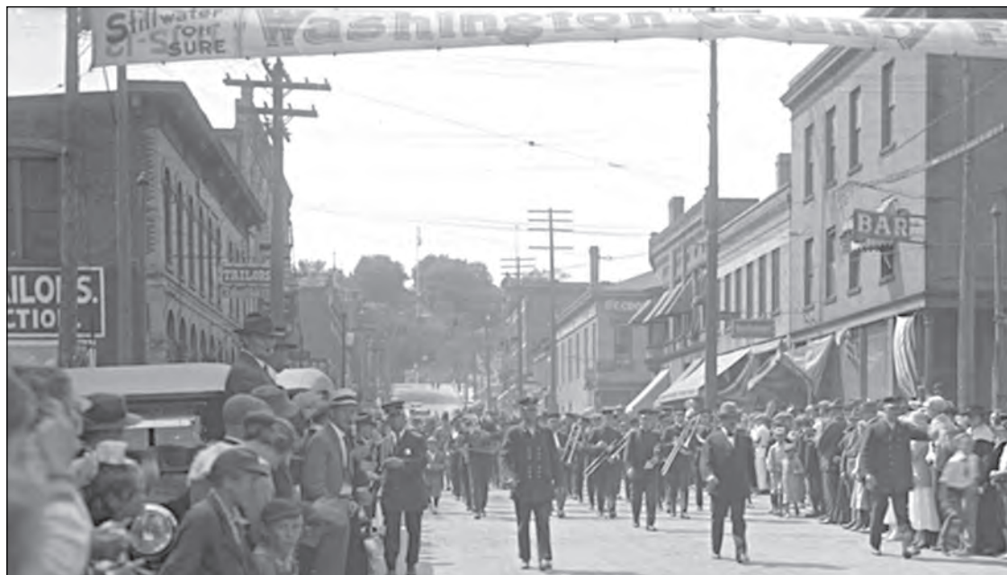
An early Washington County Fair parade in downtown Stillwater