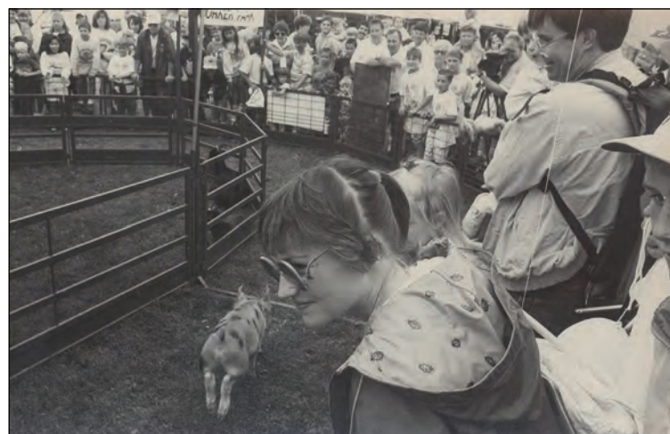
Washington County Fair pig races are held in 1991.