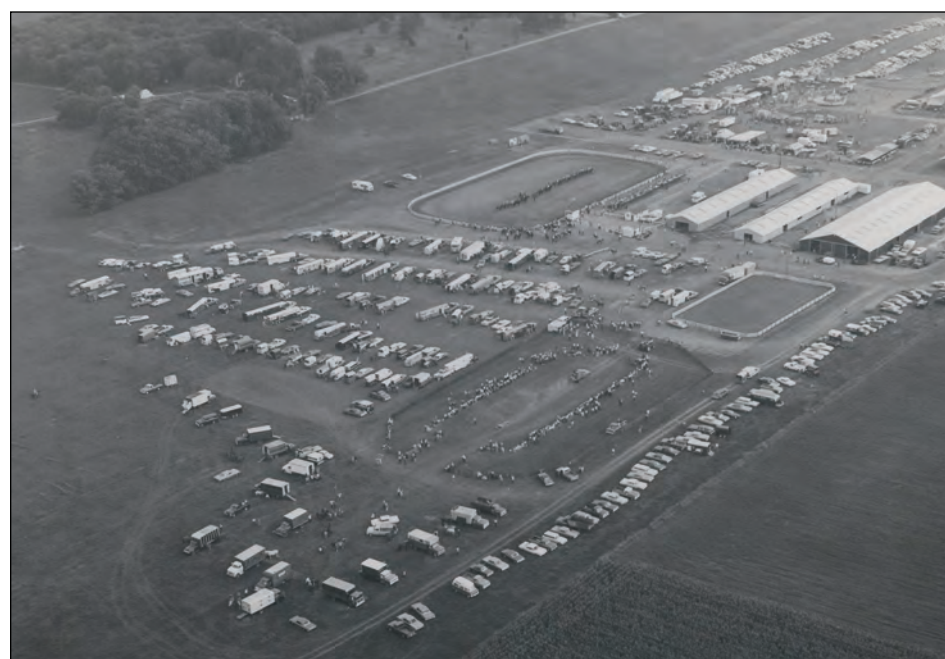
Pictured are the The Washington County Fairgrounds in 1975.