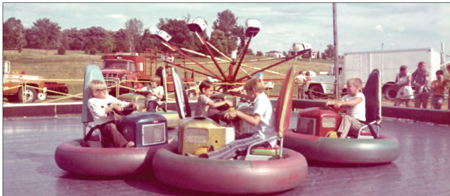
Kids ride a Washington County Fair Midway ride in 1973.