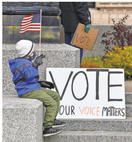
People hold signs and a flag during the march, which was bookended by speeches from candidates.