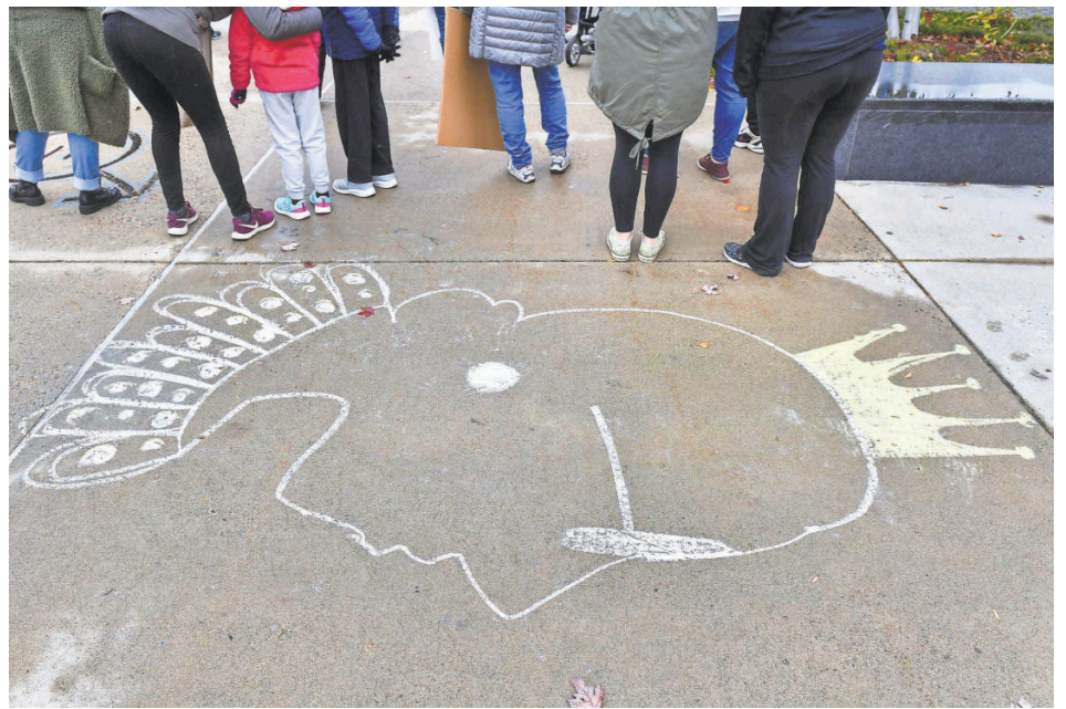
A chalk drawing of Ruth Bader Ginsburg adorns a section of sidewalk as people gather for the St. Cloud Women's March in downtown St. Cloud.

Support local journalism. Subscribe to stcloudtimes.com today.