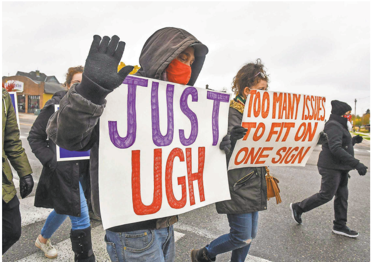
Marchers make their way toward the Stearns County Courthouse during the St. Cloud Women's March on Saturday in downtown St. Cloud.