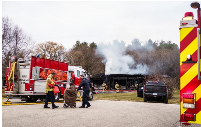
Rochester Firefighters work to extinguish a fire at 707 Upper Meadow Lane on Tuesday, November 17, 2020, in northwest Rochester.