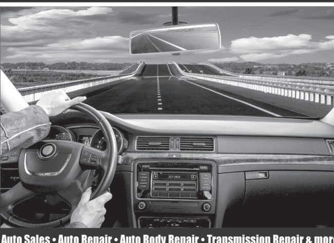
Auto Sales • Auto Repair • Auto Body Repair • Transmission Repair & more!

THE TRANNY SHOP 801 1st Ave SW Austin, MN 507-437-0037 SOUTHWEST SALES 1608 12th St SW Austin, MN 507-437-1316 NORTHSTAR BODY SHOP 25446 US Hwy 218 N Austin, MN 507-433-4609