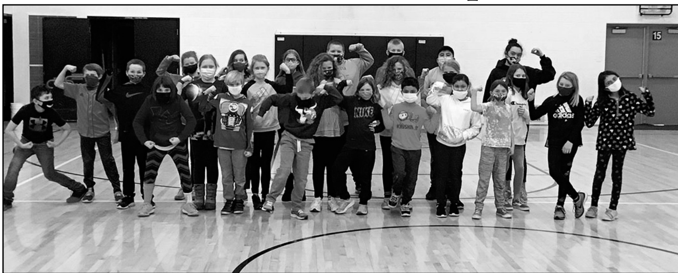
Pictured here, the top "Healthy Heart" fundraisers at Pelican Rapids Viking Elementary School.