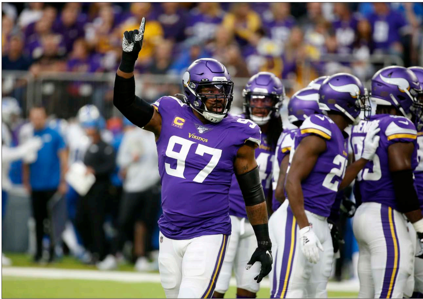
The Minnesota Vikings are bringing back defensive end Everson Griffen, now the fourth player on defense to rejoin the team this year after time away with another team.

Griffen came to the NFL as a work in progress out of USC