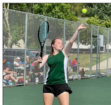
Tennis Girls tennis season preview. 3B